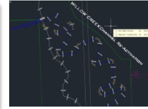
Before-After New Willow Channel